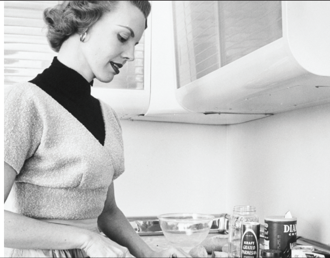
WOMEN AND THE SUBVERSION OF THE COMMUNITY Marianosa Dalla Costa & Selma James

W E MUST DISCOVER FORMS OF STRUGGLE WHICH IMMEDIATELY BREAK THE WHOLE STRUCTURE OF DOMESTIC WORK, REJECTING IT ABSOLUTELY, REJECTING OUR ROLE AS HOUSEWIVES AND THE HOME AS THE GHETTO OF OUR EXISTENCE, SINCE THE PROBLEM IS NOT ONLY TO STOP DOING THIS WORK, BUT TO SMASH THE ENTIRE ROLE OF HOUSEWIFE.