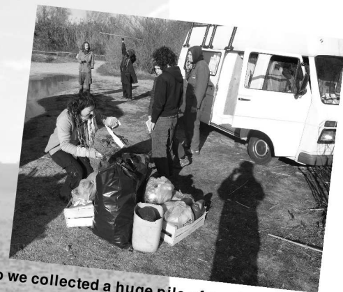
... So we collected a huge pile of trash together!

I proposed to do a Rama dama here, and some people joined enthusiastically :-)