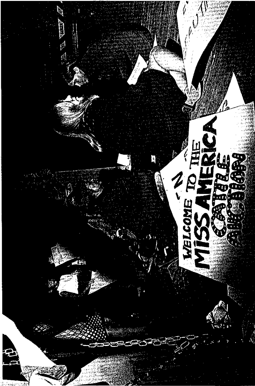
Atlantic City, NJ, September 7, 1968—Feminists picketing the Miss America pageant, shown here during a break in their protest.