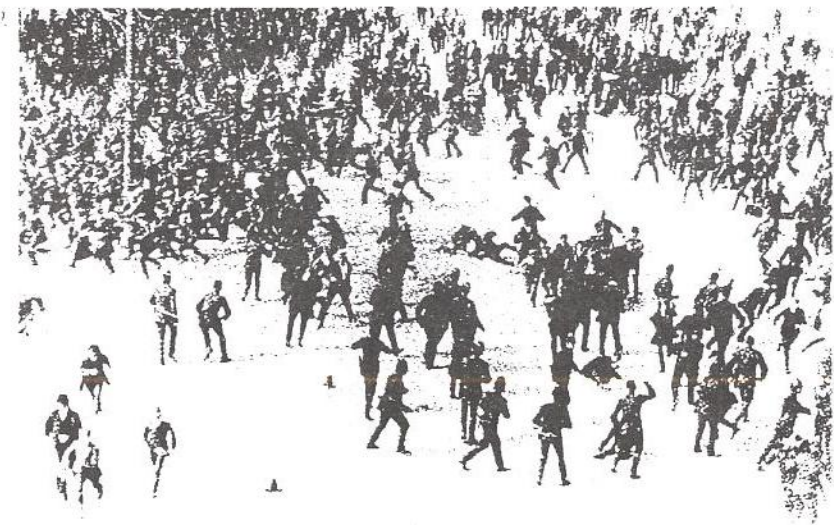
Police attack strikers in O'Connell Street, Dublin, 1913. It was such police violence against strikers which prompted White to suggest the formation of the Irish Citizen Army.

The state-worship of Communist and Socialism has its source in the failure to lay enough stress on the inner spontaneity of people, and a consequent enslavement to outer externalised forms, such as the State as the source and key to power. The people's only road to real freedom lies in the voluntary co-ordination of their maximum individual spontaneity. All social panaceas that seek to supersede that co-ordinated spontaneity, even as a means to the alleged ends of restoring it, must lead not to freedom but to the loss of such freedom as the people have achieved and to increasing depths of tyranny.