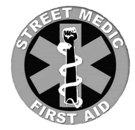
-Star of Resistance

In the U.S., street medics often identify themselves with red duct tape crosses on clothes and packs. Usually working in buddy pairs, medics sometimes coordinate as teams for larger events and clinic spaces. A generallyaccepted minimum level of training to work as a street medic consists of 20 hours of basic first aid, particulars of medicking at political events, and how to deal with police weapons and tactics. However, many Street Medics also have other kinds of formalized training—as EMTs, nurses, Wilderness First Responders, herbalists, acupuncturist and others. Street medic groups, independent medics, and similar or allied providers exist all over North America and many parts of the globe—adapting their training and practices to local needs.<sup>5</sup>